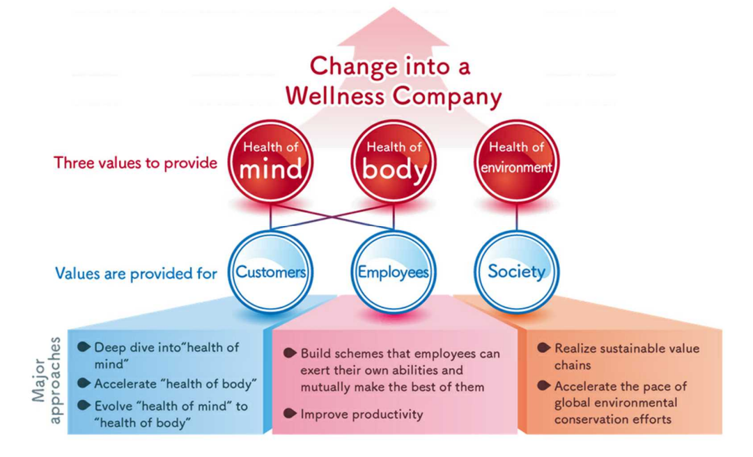
(Figure 3: Overview of the 2030 Business Plan)

In May 2021, Morinaga also formulated the 2030 Business Plan, a long-term management plan for 2030, and set forth its vision for 2030 "The Morinaga Group will change into a wellness company in 2030."