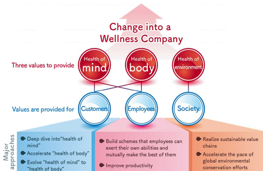
Figure 2: Overview of the 2030 Business Plan 15

In May 2021, Morinaga also formulated the 2030 Business Plan, a long-term management plan for 2030, and set forth its vision for 2030 "The Morinaga Group will change into a wellness company in 2030."