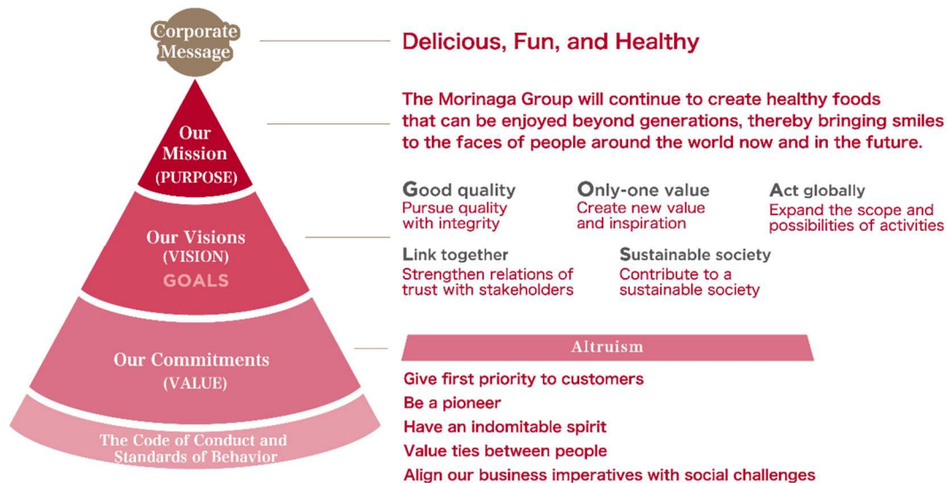
Figure 1: The Morinaga Group's Corporate Philosophy 14

In its Corporate Philosophy, Morinaga has defined its mission (Purpose) and as a message that expresses the Purpose in a concise manner, it has set forth a corporate message "Delicious, Fun, and Healthy."